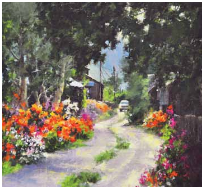
Up the Alley, oil, 16 x 16.